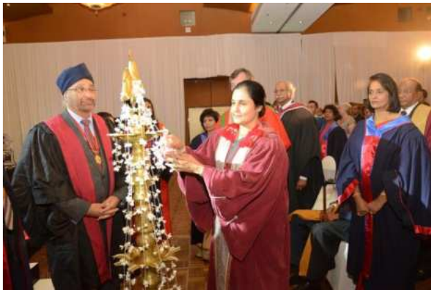
Lighting the lamp of learning