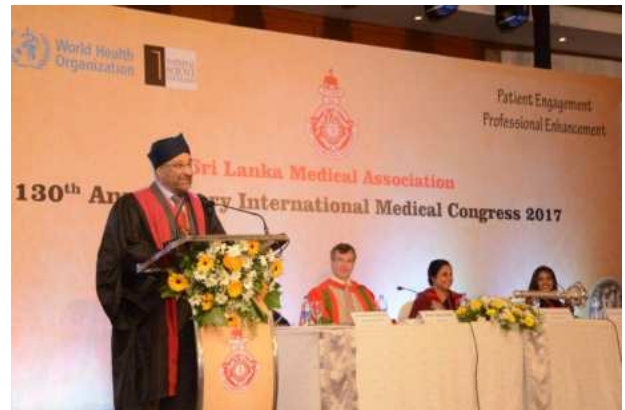
Address by Chief Guest