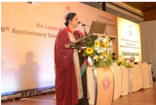
Welcome address by President SLMA