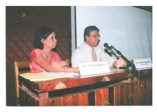
The President/SLMA addressing the gathering Seminar on "Dengue Hemorrhagic Fever"

15<sup>th</sup> August 2010, at 8.30 a.m. at the Lionel Memorial Auditorium