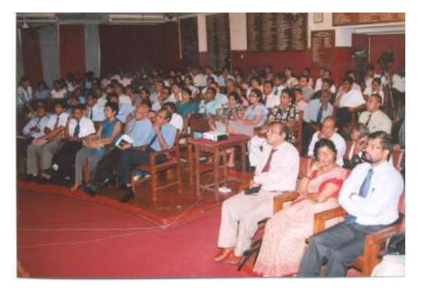
A section of the crowd