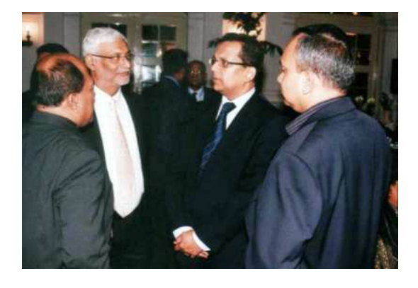
Fellowship at the conference dinner