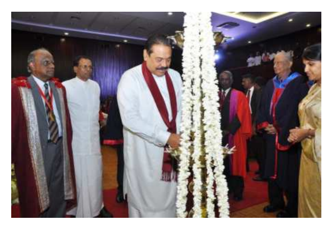
Lighting of the oil lamp