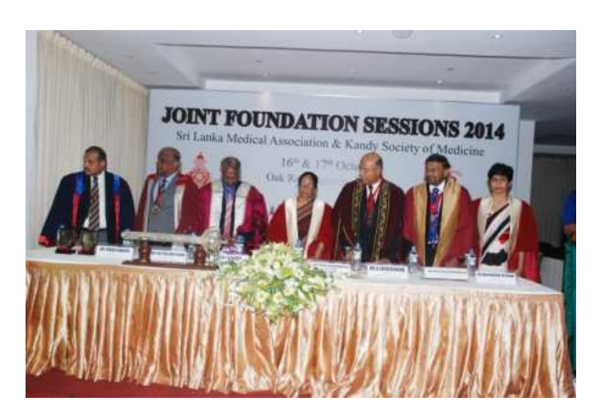
Head table of the inauguration ceremnony