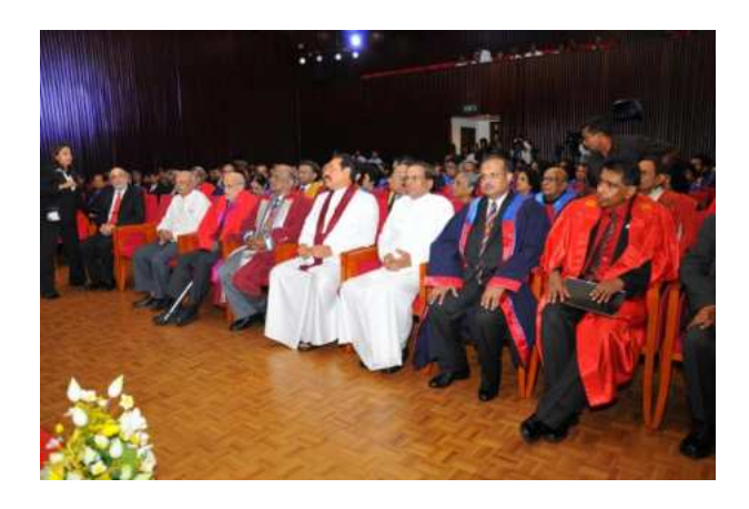
Section of the invitees