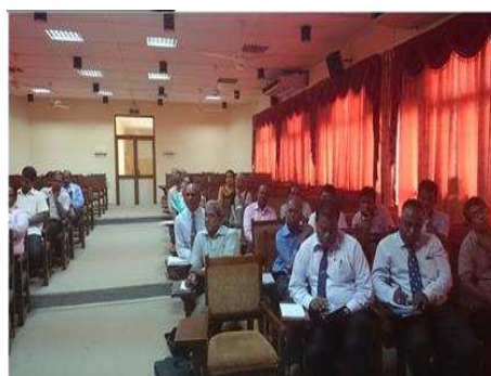
Participants at the Discussion Forum on Water Pollution in Jaffna