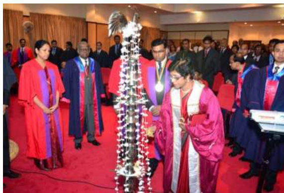
Lighting of the oil lamp