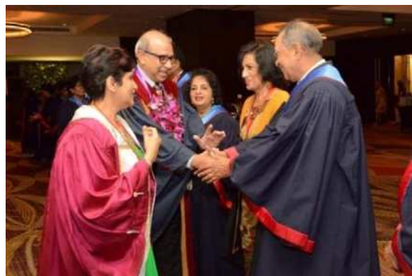
Introducing the Past Presidents to the chief guest