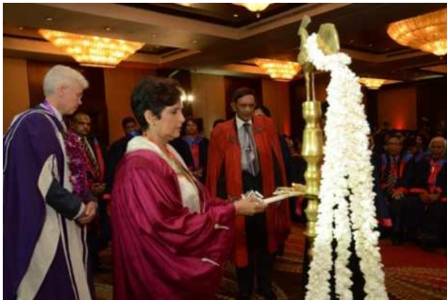
Lighting of the oil lamp