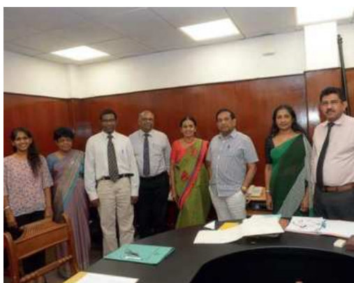
Meeting with the Hon. Minister of Health

The Minister was informed about the activities of the SLMA including the new venture of the SLMA which commenced this year, namely the monthly awareness programme for the media and the public, based on a health issue as declared by the United Nations or World Health Organisation. He perused the Annual Academic Sessions programme to be held in July and commented very favourably on the wide variety of topics scheduled to be covered at the Congress. He accepted the invitations to be the Chief Guest at the SLMA Annual Academic Sessions Inauguration and the Guest of Honour at the SLMA Run & Walk. He also agreed to make a substantial financial allocation from the Ministry funds for SLMA activities. The SLMA congratulated him on the firm stance taken by him against tobacco use in Sri Lanka, and also appreciated the great benefit he had provided to the people of Sri Lanka by offering free stents lenses for cataract surgery and the reduction of price of more than 50 essential drugs.