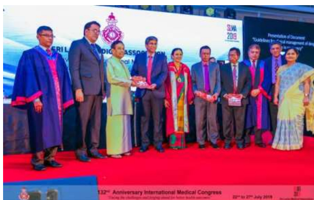
Presentation of National Guideline on Clinical Management of Dengue Fever in Pregnancy