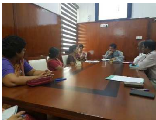
Meeting with the Director General of Health Services