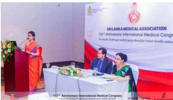
Pre congress session on Respiratory Medicine