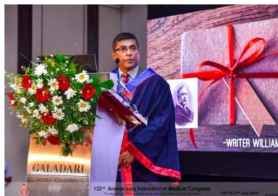
Vote of thanks by Hon'y Secretary SLMA