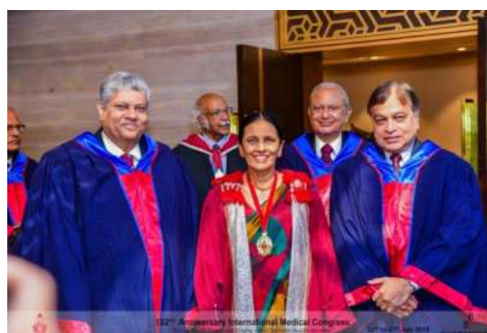
With the Guest of Honour and Conference Chairperson