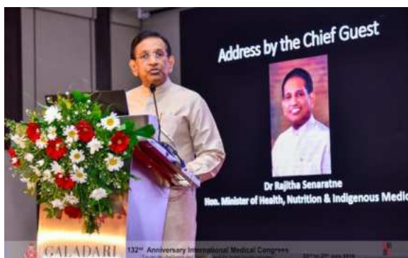
Address by Chief Guest