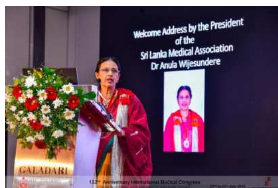
Welcome address by President SLMA