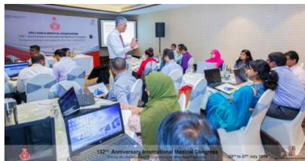
Pre congress workshop on Communication Skills